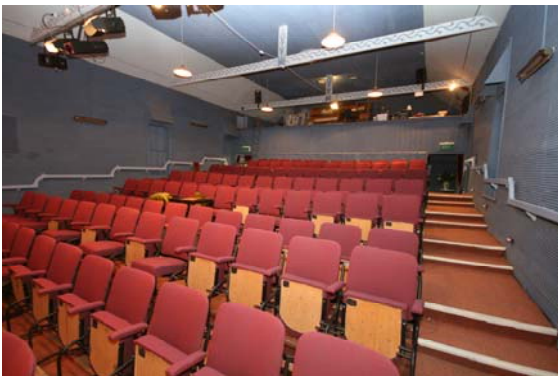
Bijou Theatre - looking towards main entry end of Auditorium (from stage)