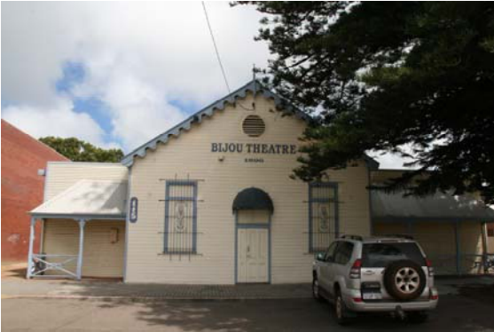
Main Entry Doors to Venue