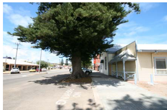
On-street parking in front of Bijou Theatre