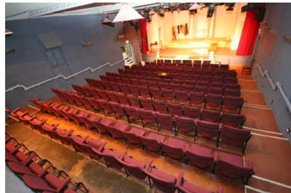
Bijou Theatre - looking towards stage (from Bio Box / entry end of Auditorium)