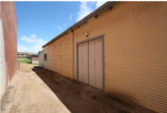
Side of Venue (Load in from Truck)