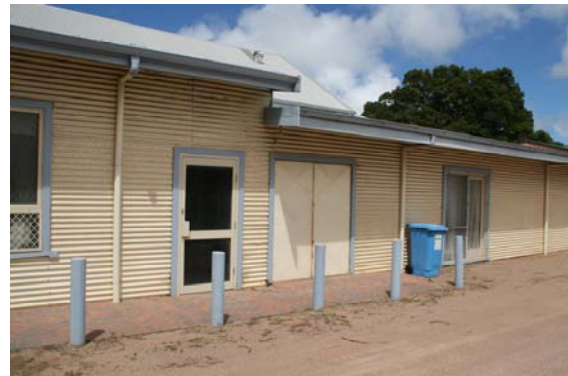
Side of Venue (possible load in through alternate side exit doors)