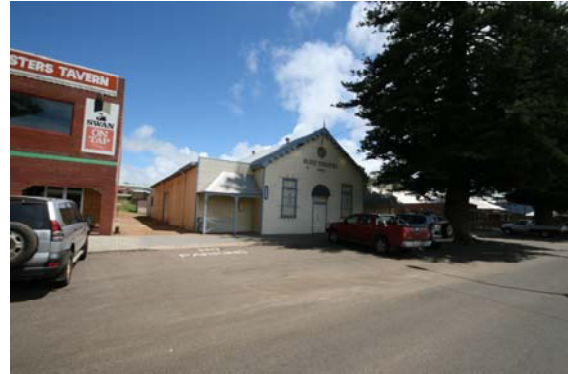
3D view of front of Venue