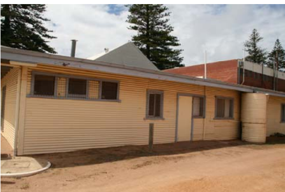
Rear of Venue (Load In to BOH Green Room)