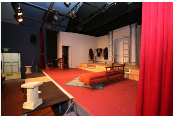
Stage in Bijou Theatre