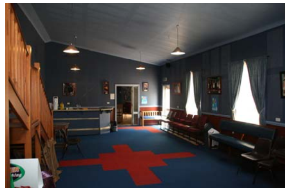
Supper Room (door to toilet passage way in background) (entry foyer & bar on left of staircase)