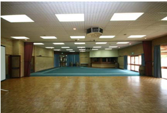
Civic Centre - looking towards main entry & bar end of hall (from stage)