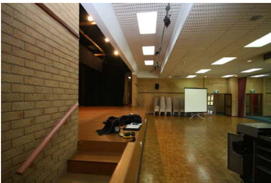
Stage in Harvey Rec & Cultural Centre