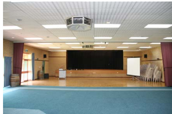
Civic Centre - looking towards stage (from entry & Bar end of room)