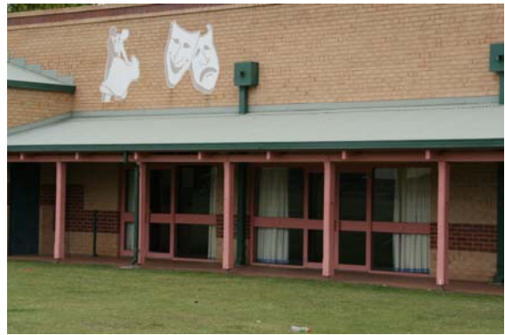
Alternative load in access at front of venue (through double doors and into side of auditorium)