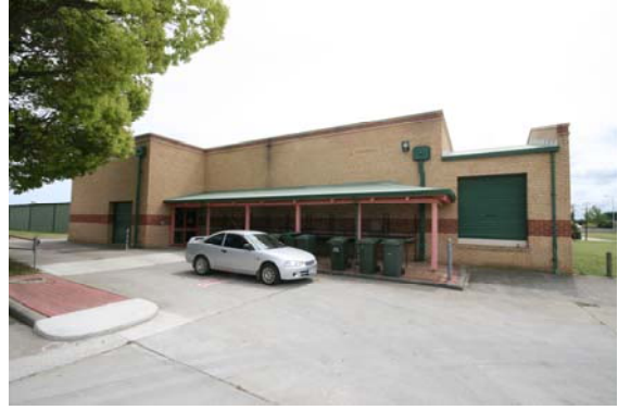
Side of Venue (Rear of Stage) (Artist entry through doors on left)