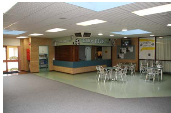
Harvey Rec & Cultural Centre Foyer (main function hall thru doors on right)