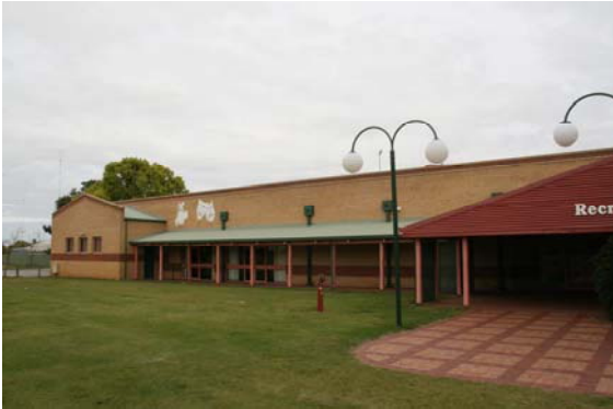
Main Entry Doors to Venue