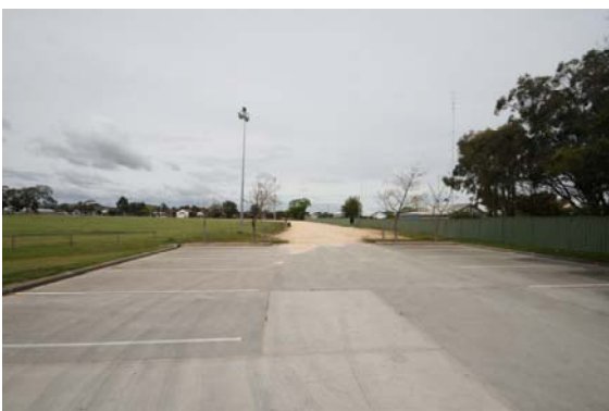
Plenty of parking at side of venue (Truck & Bus access also)