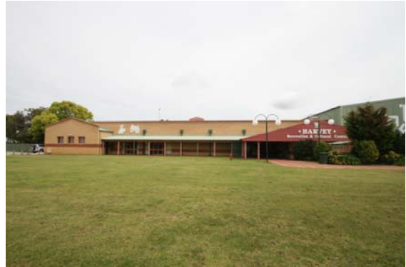
Gardens & Pathway leading to front of Venue