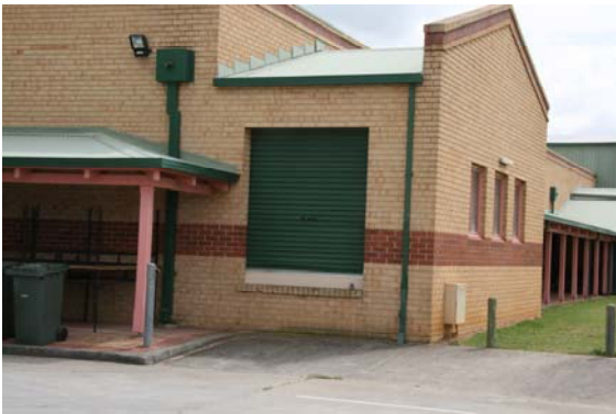
Rear of Stage (Load in from Truck)