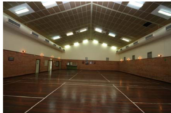
Hall - looking towards Bar & Kitchen (from the stage end of the room)