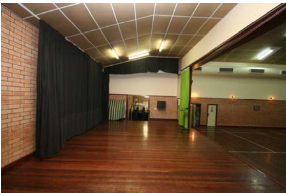
Stage in Hugh Kilpatrick Memorial Centre