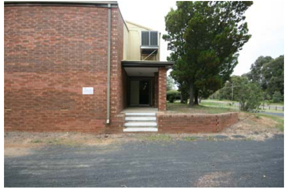
Rear of Stage (possible load in through side exit doors)