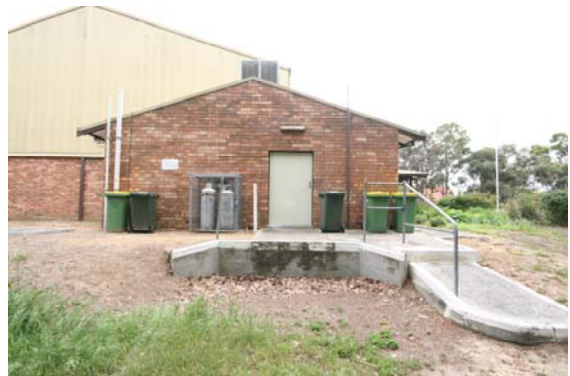
Kitchen Loading Dock & Back Door