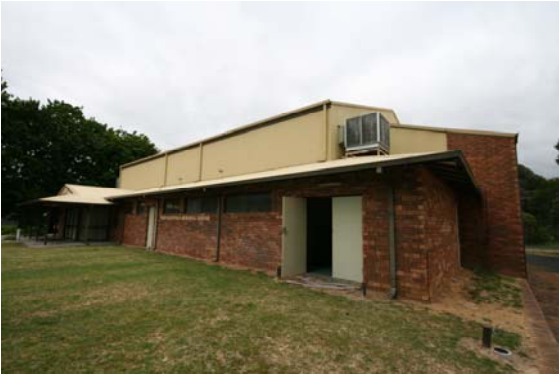
Side of Stage doors (storage/side of stage area)