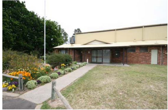
Main Entry door on front of Venue