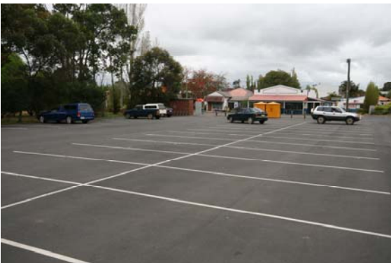
Parking in front of Venue