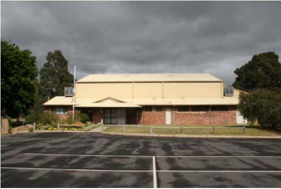
Front view of Venue