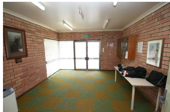
Hugh Kilpatrick Memorial Centre Foyer (taken from main function hall doors)