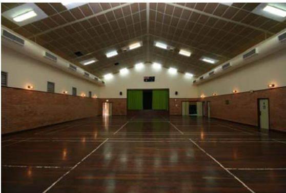
Hall - looking towards the stage (from entry end of hall)