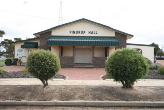
Pingrup Hall (from road)