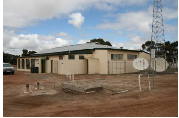
Rear of Venue