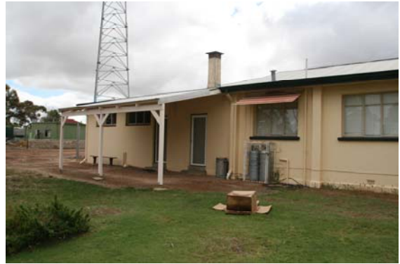
Kitchen Door & Clinic Nurse Office Door