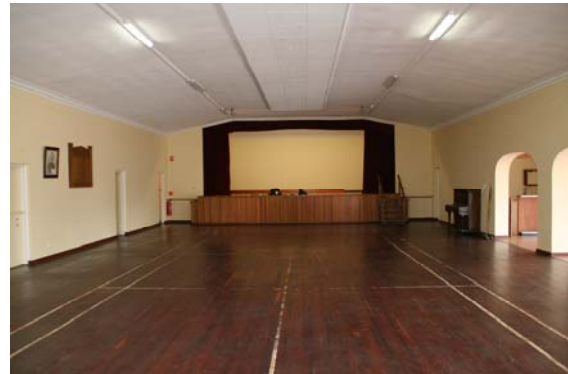
Pingrup Hall with stage (from main entry end of room)