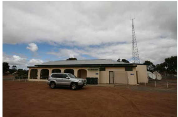
Side Entry door to Pingrup Hall (Load In from truck)