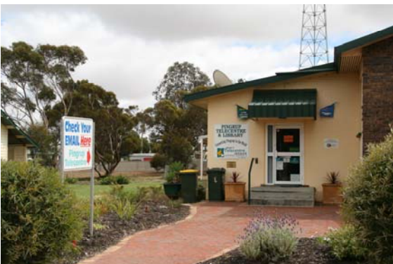
Telecentre on left side of Hall