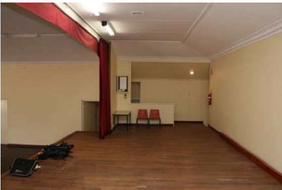
Pingrup Hall Stage (from PS looking towards OP)