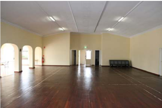
Pingrup Hall (from stage end of hall)