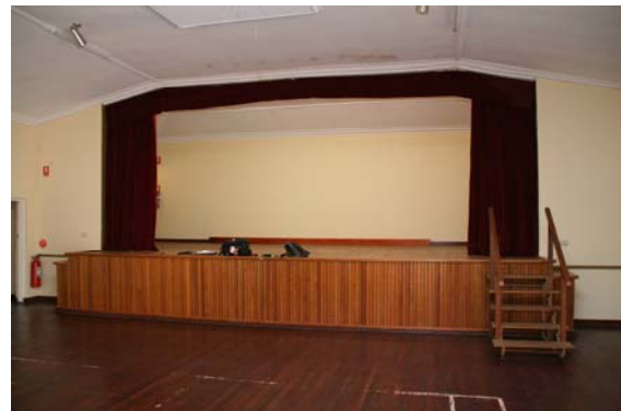
Pingrup Hall Stage