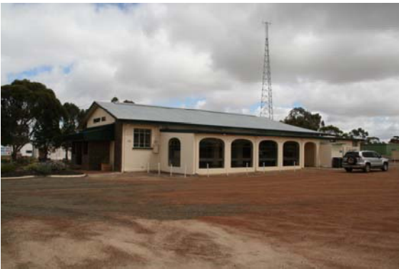
3D of front & side of Venue