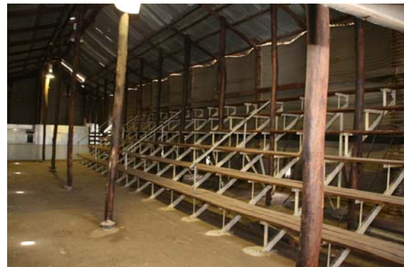
Tiered bench seating in Pingrup Shears Building (from entry end of room)