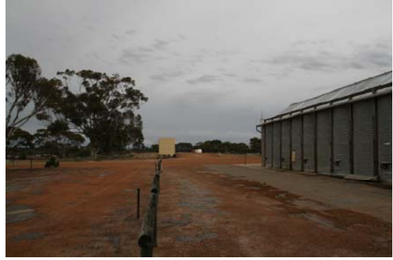
Rear of Venue (looking towards car park)