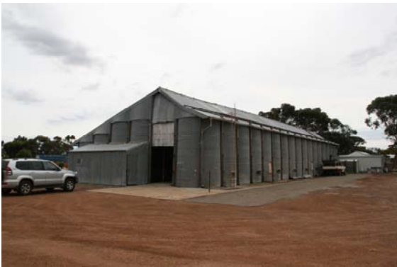
3D of side & Rear of Venue (Load in from Truck)