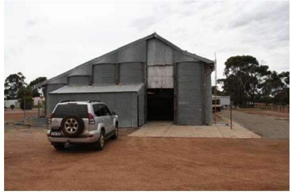
Entry door to Pingrup Shears Building (Load In from truck)