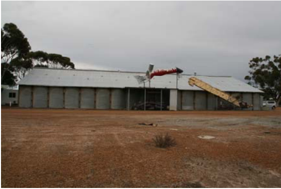
Pingrup Shears Building (from road)