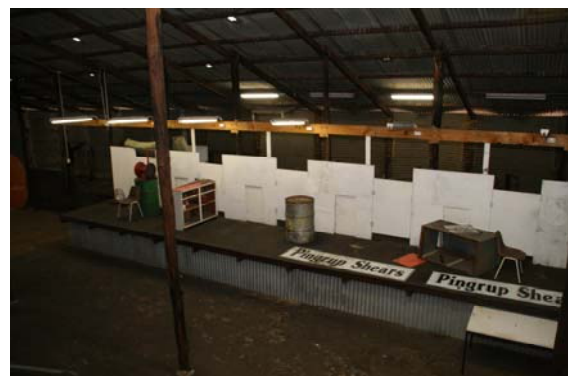
Shearing Deck in venue