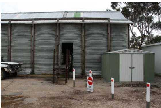
Sheep Loading Door (At Rear)