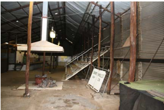
Pingrup Shears Building (fire pit in foreground) (from entry door end of building)