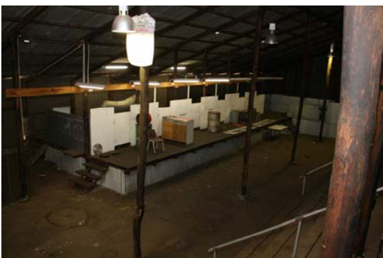
Shearing Deck area in venue (tiered seating on the right of picture)