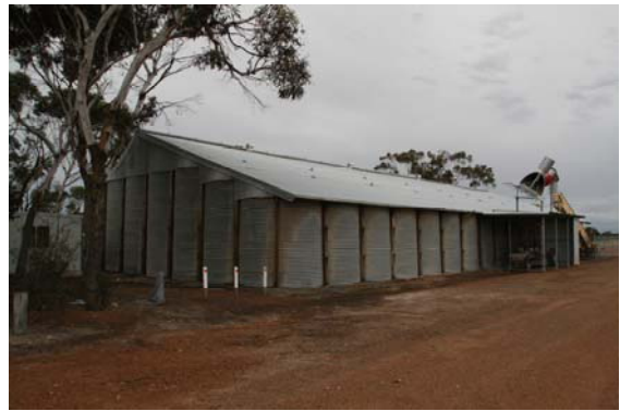
Front 3D of venue