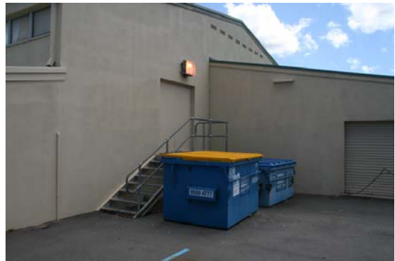
Alternative load in access at rear of venue (through double doors and straight onto stage)