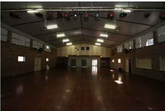
Civic Centre - looking towards main entry end of hall (from stage)