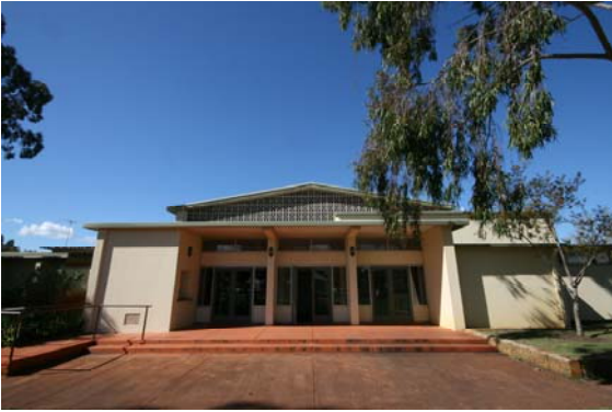
Main Entry Doors to Venue