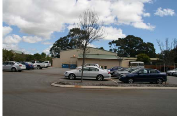
Rear of Venue (& plenty of truck/bus/company parking)