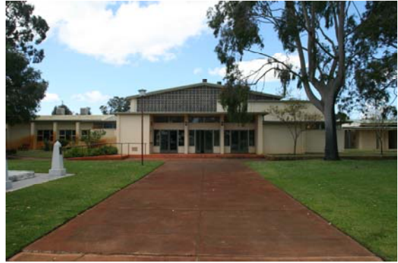
Gardens & Pathway leading to front of Venue