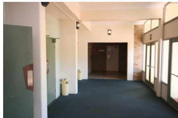
Pinjarra Civic Centre Foyer (main hall thru doors on left, to outside on right)