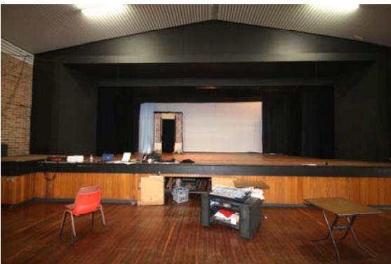
Stage in Pinjarra Civic Centre