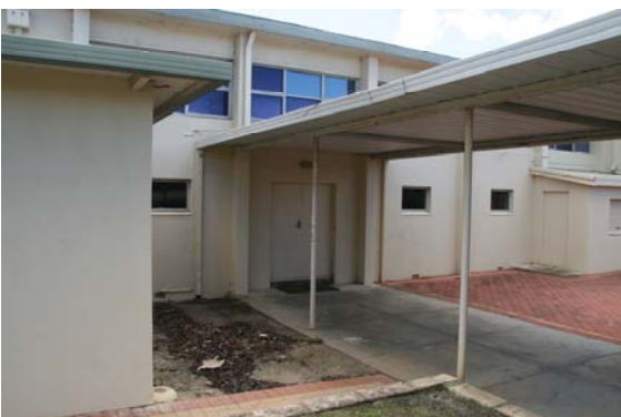
Load in access at side of venue (through double doors and into auditorium)