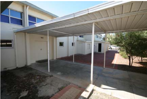
Side of Venue (Load in from Truck)