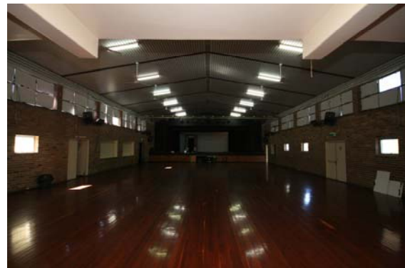
Civic Centre - looking towards stage (from entry)