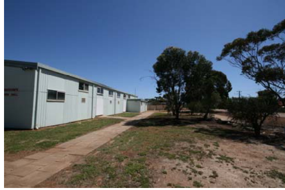
Side of Venue (possible load in through side exit doors)