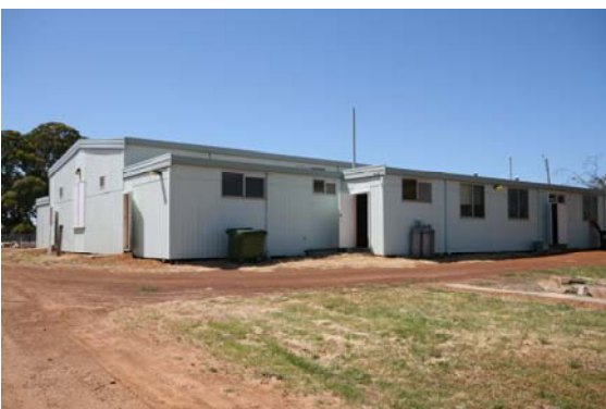
Side of Venue (Load In to Kitchen)