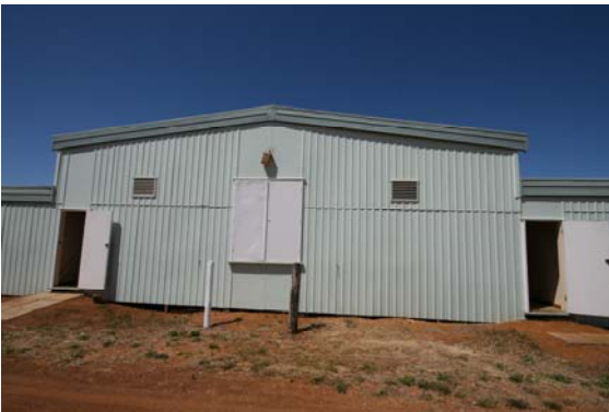
Rear of Stage (Load in from Truck)