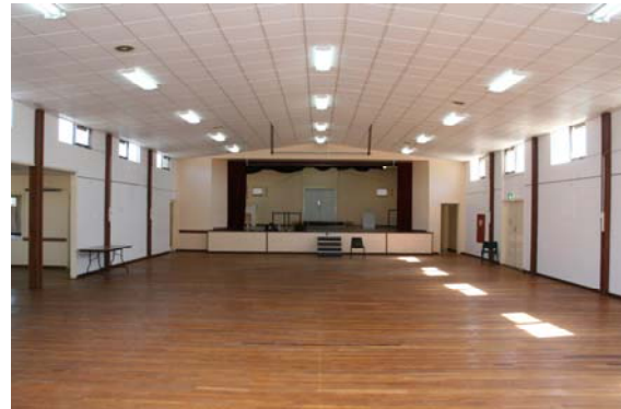
Town Hall - looking towards stage (from entry end of room)