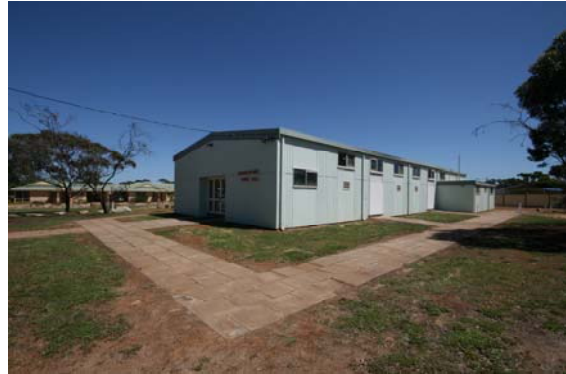
3D view of front of Venue