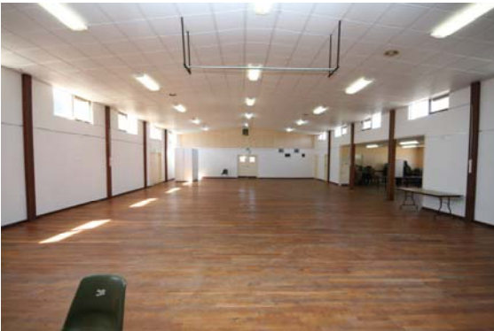
Town Hall - looking towards main entry end of hall (from stage)