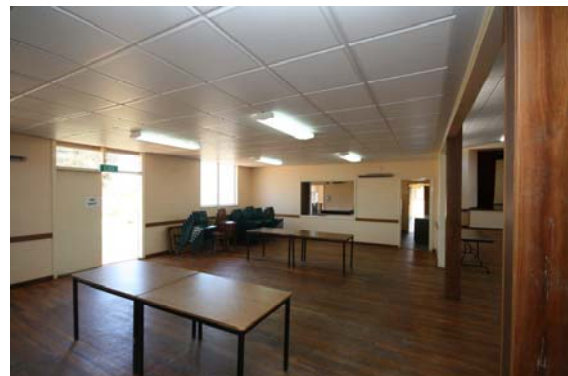
Supper Room (main hall thru arches on right) (looking towards kitchen servery window) (exit doors on left)