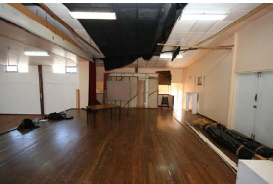
Stage in Ravensthorpe Town Hall