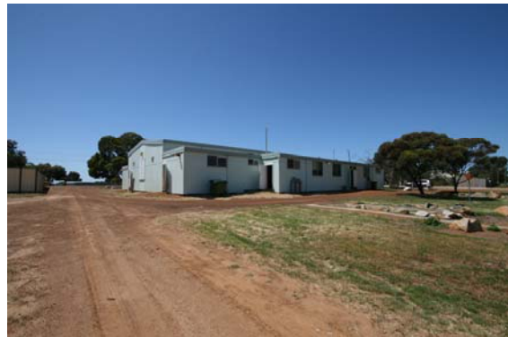
Parking at rear for Truck & Bus