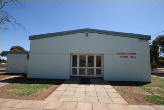
Main Entry Doors to Venue