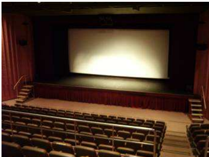
Photo taken while cinema screen onstage

There are two fully-equipped dressing rooms with laundry facilities backstage, and the direct to stage load-in is excellent.