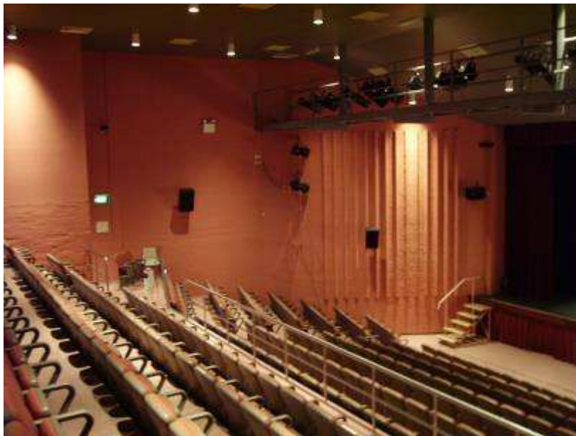
Shows FOH lx gantry and side booms