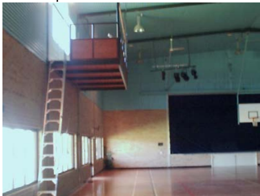
FOH control box; side windows