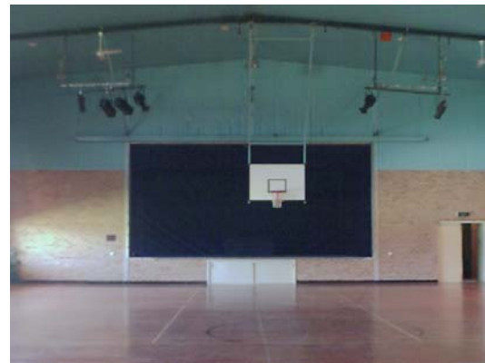
Proscenium arch; FOH LX; basketball hoop swings up for performances