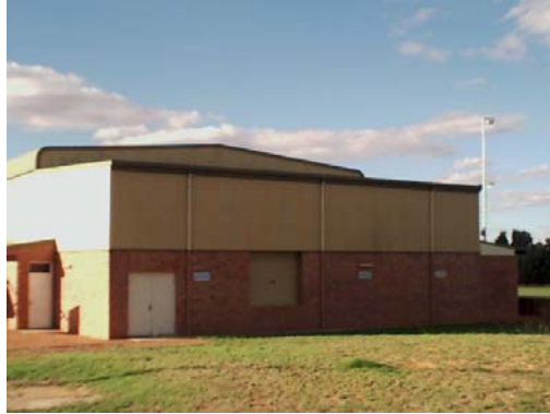
Rear of building shows loading door