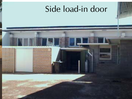
Side load-in door