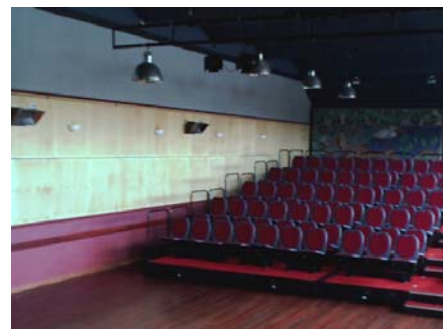
Rear corner of auditorium seating