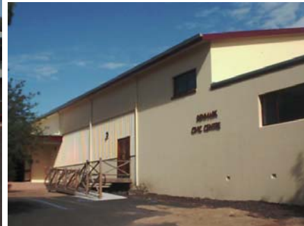
Main public entrance: centre right of picture Side load-in door obstacle course