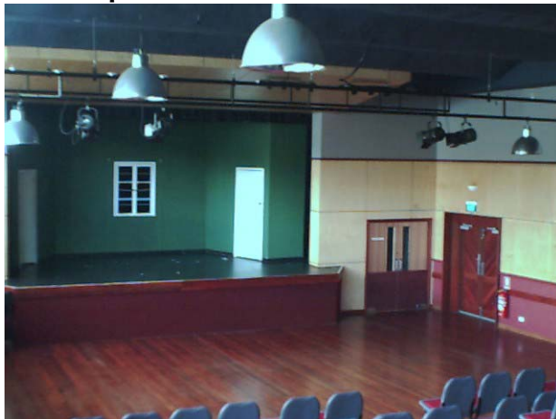
Photo shows green scenery onstage