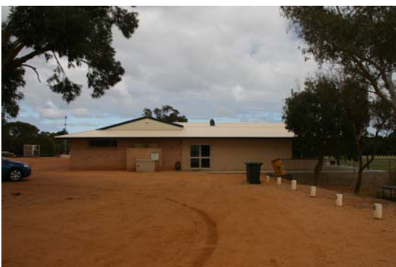
Load in Access from car park