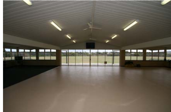
Function space, facing towards sliding doors to oval