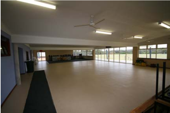
Main side function space