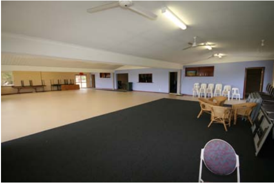
Function space, facing towards Kitchen & Toilets