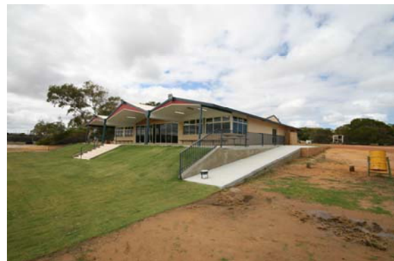
3D view of venue (showing ramp)