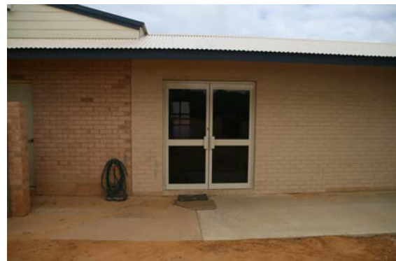
Load in Access double doors