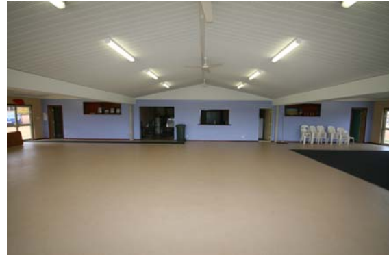
Function space facing Kitchen and Toilets