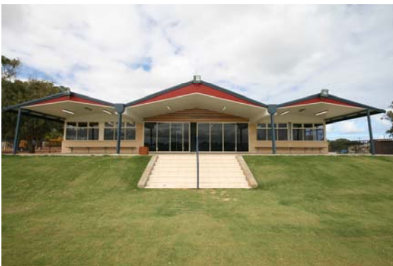
View of front of venue (from Oval)