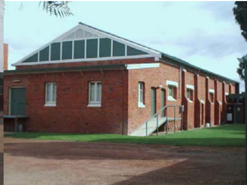
Rear side loading door and ramp