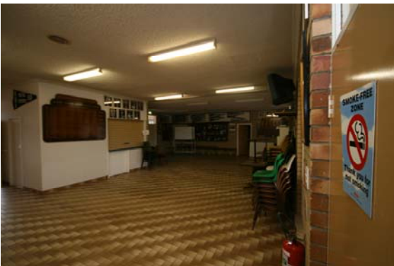
Lake King Sports Pavilion entry end of venue (view from main doors)