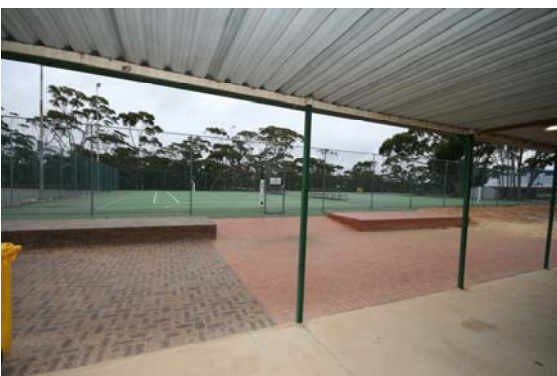
Sports courts at rear of venue