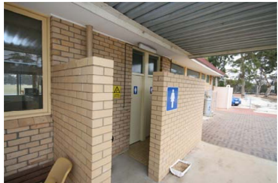
Public Toilets at rear of venue