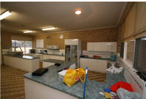
Canteen style kitchen in Sports Pavilion