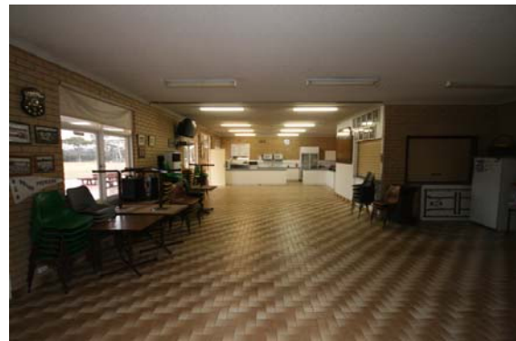
Lake King Sports Pavilion (from female change room end)