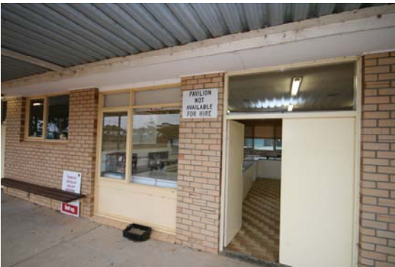
Main Entry Doors (Load in Access)