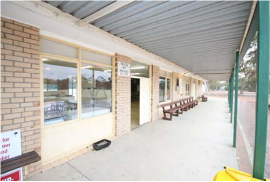
3D View of front of venue