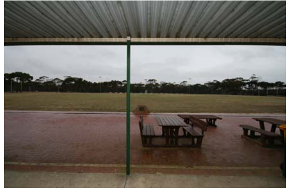
Sports field outside front doors