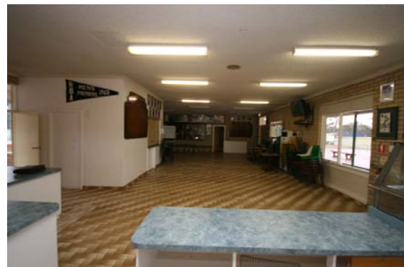
View of Sports Pavilion from kitchen