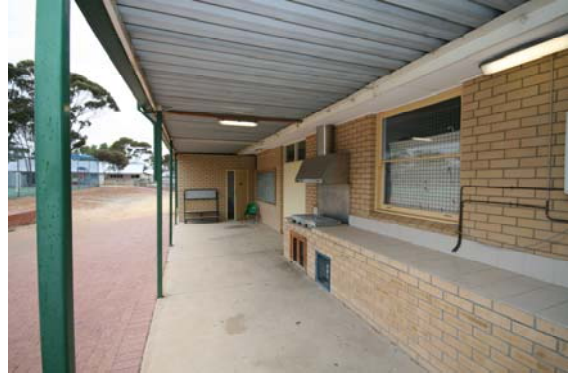
Rear of Venue