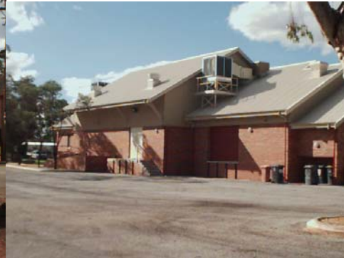
Load in door