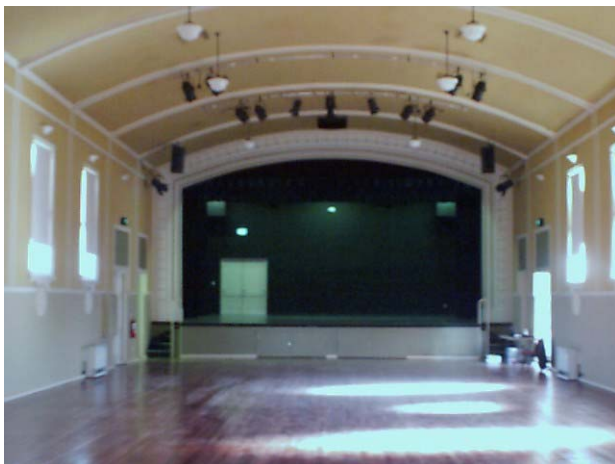
Shows FOH lighting bars and side perches, L + R and centre fill speakers.

I judged the acoustics to be worthy of caution, but local advice says that an audience deadens the ring. The wiring is new and bound to have teething problems...check your lines early...watch for earth loop.