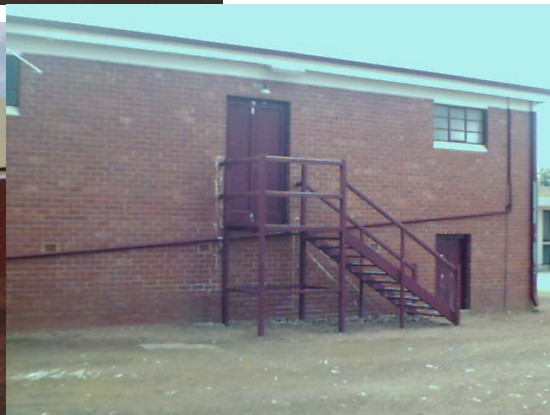
Rear bump in door and stairs* back rails are removable, but well above truck floor height.