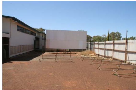
Mt Magnet Cinema (outdoor cinema next To ANZAC Hall, as seen on left of this pic)