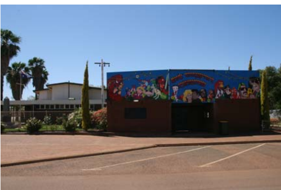
Mt Magnet Cinema alongside ANZAC Hall