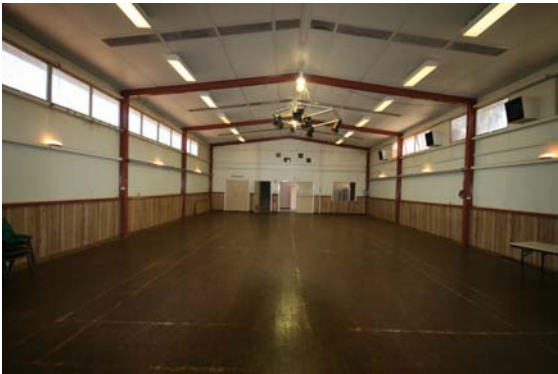
ANZAC Hall - looking towards main entry end of hall (from stage)