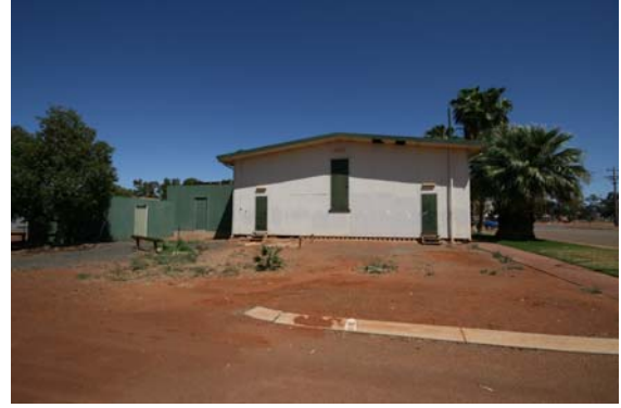
Rear of Venue (& Dressing Room doors)