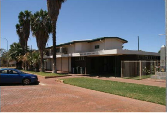
3D View of front of venue