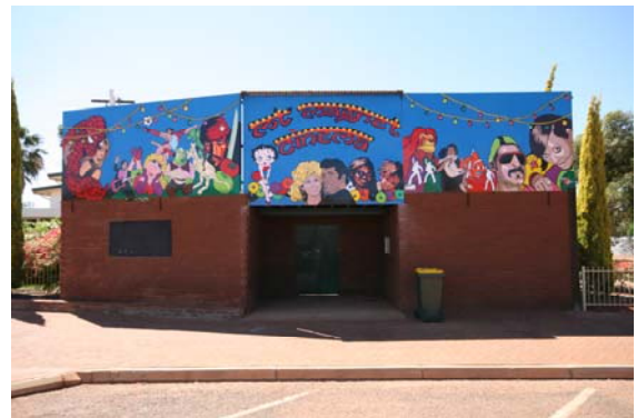
Mt Magnet Cinema (frontage)