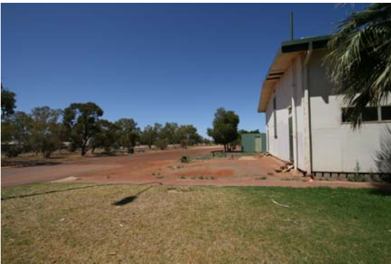
Rear of venue, including space for car parking & truck parking