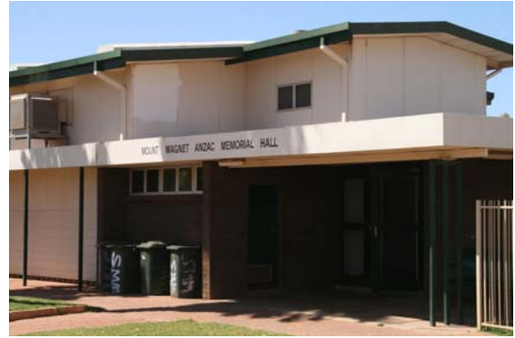
Main Entry Doors to Venue