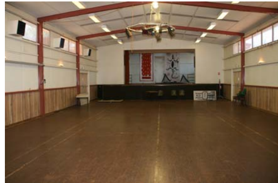
ANZAC Hall - looking towards stage end (from entry)