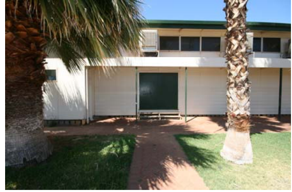
Load in access at Naughton St side of venue