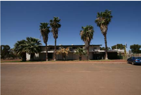
Side of Venue (Naughton St)