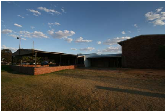
3D View of front of venue