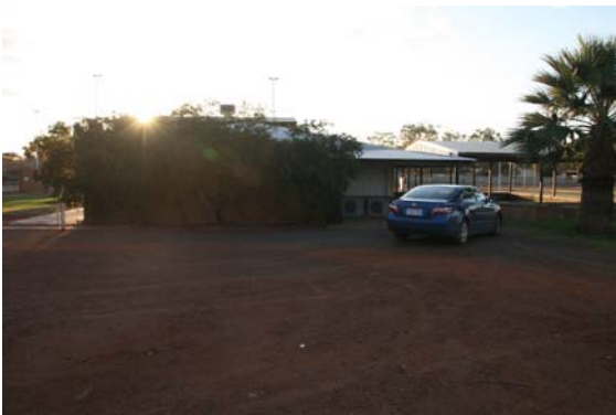
Side of Venue (Laurie St)