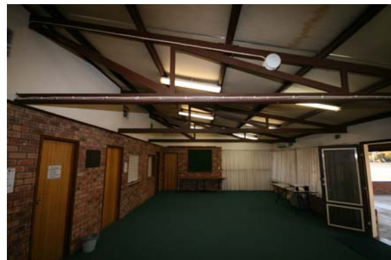
Rec Centre - Inside