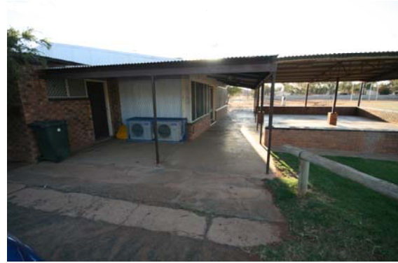
Load in - under veranda and through double doors to the left