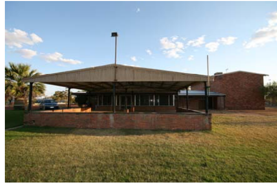
Front of Venue