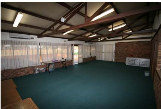
Rec Centre - looking towards main entry to space