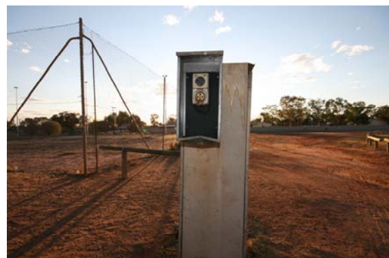
Power box outside, with 3phase outlet