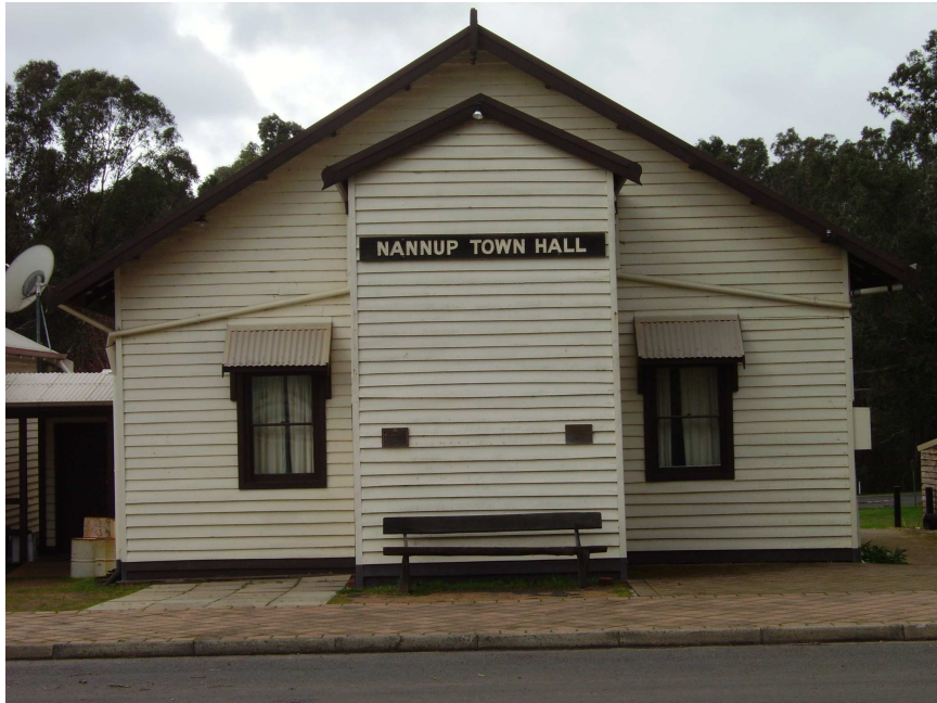
Main front entrance