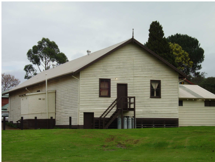
Rear view from village green