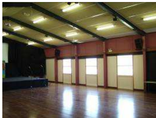
Side windows with black roller-blinds