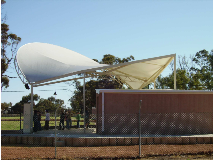
From behind stage left