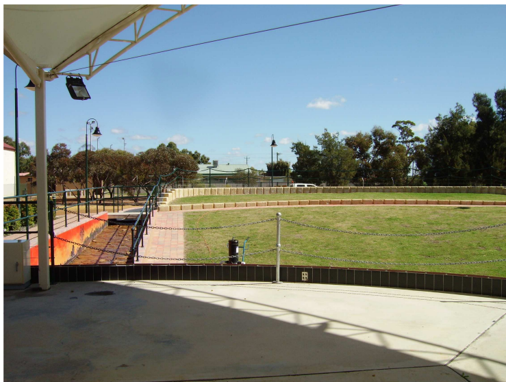
Side view from stage

The 7600 long x 3450 high rear trussing bar in front of the building could act as a support for a backdrop. Estimate a backdrop of 6500 x 3400 with scaffold bar in the top and bottom sleeves to allow for chain support and weight at bottom.