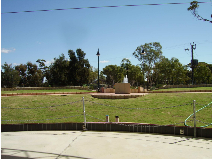
Front view from stage