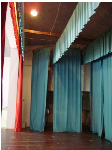
Stage right masking