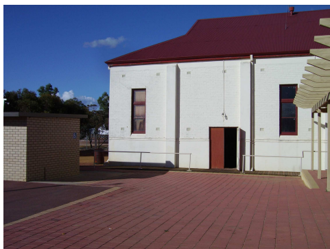
Side load-in door