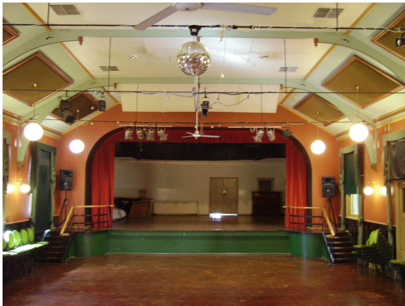
Proscenium arch stage: Note there are two panels in the roof which hinge down to reveal higher lighting bars

The lighting desk, dimmers and desk are well overdue for an upgrade. At present there are two desks in the control room: one controls the FOH and one controls the onstage.